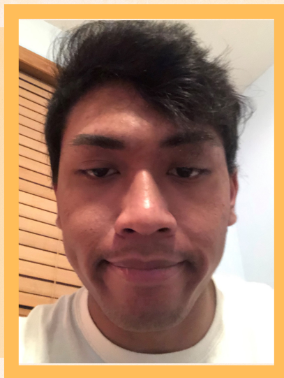
He/Him/His Civil Engineering

Definitely branched out and gone to more clubs. I worked the majority of my college life and missed out on a lot of events, so I definitely regret it. The events I were able attend to were really fun and definitely worth it, but if I could go back in time, I'd probably ask for less hours.